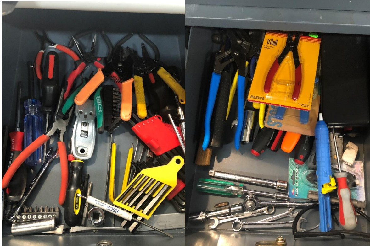
Figure 10. Tool Contents From the Drawers in One Technician Station