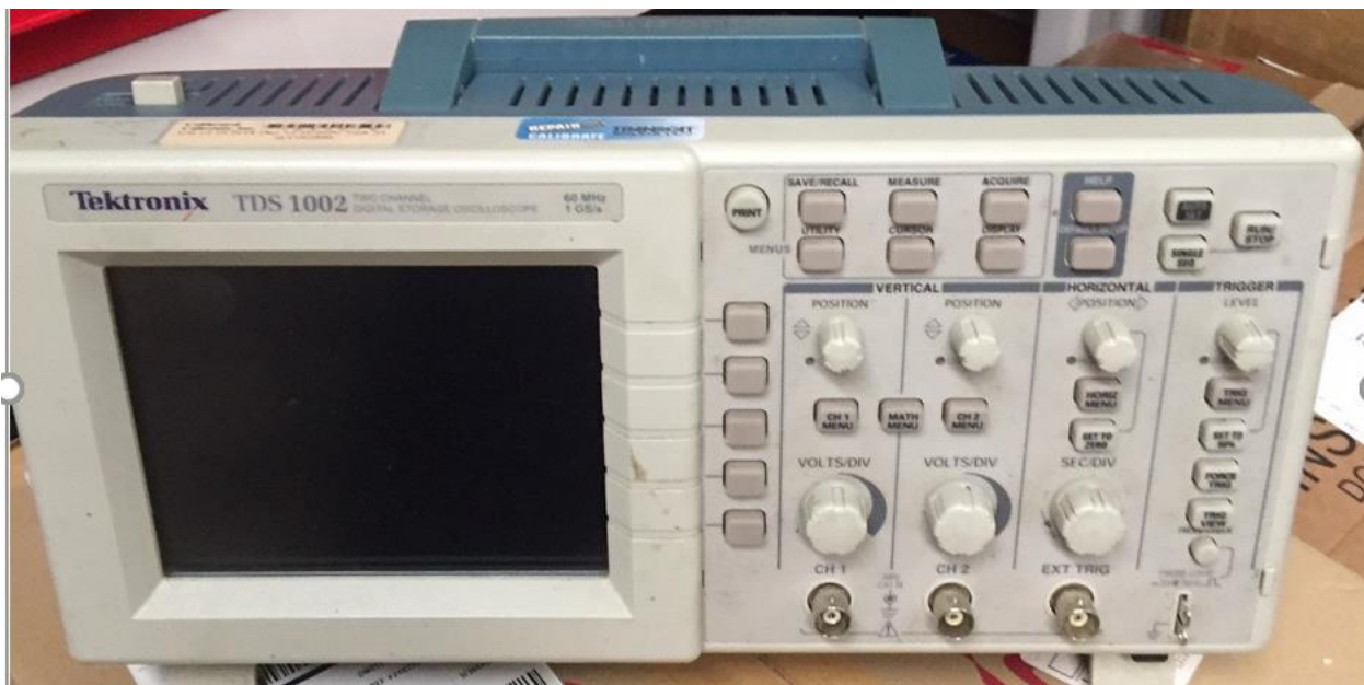
Figure 3. Tektronix Oscilloscope Model TDS 1002