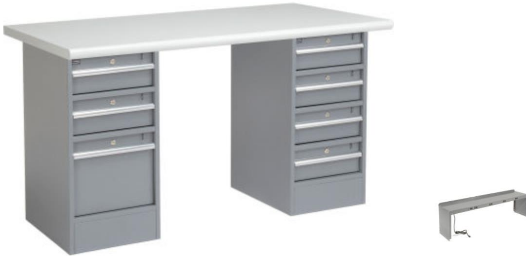
Figure 8. Work bench with drawers and power riser

The following pictures are taken from the Global Industrial web site. It is the type of furniture MJWTS has for sale with the exception that our workbenches are a darker gray as shown in Figure 1 above.