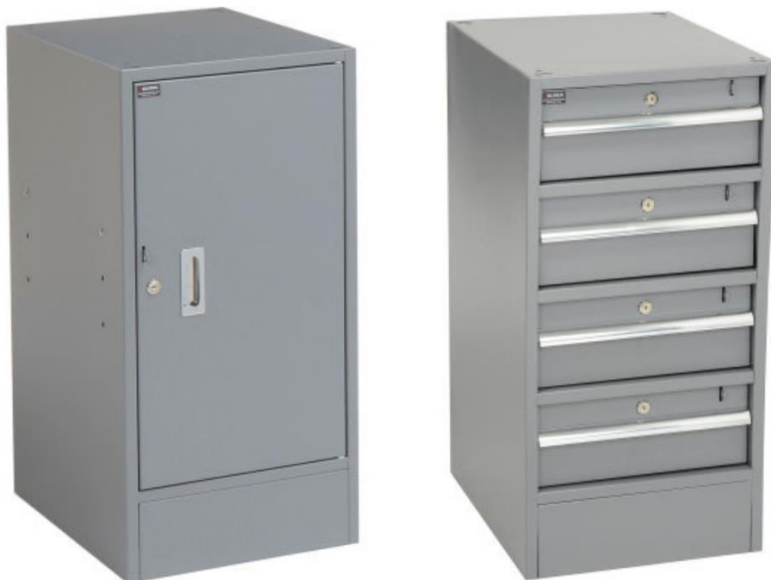
Figure 9. Cabinet and 4 Drawer Workbench Pedestals