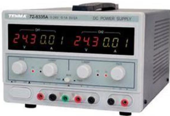
Figure 7. Tenma Bench Power Supply 72-8335