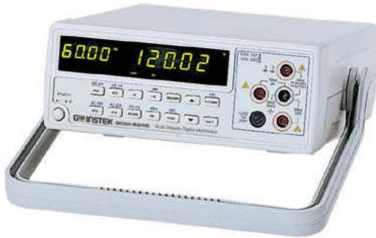
Figure 6. GW Instek GDM-8245 Multimeter