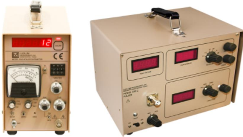
Figure 4. Ludlum Model 2200 Scaler-Ratemeter and 500-2 Pulse Generator