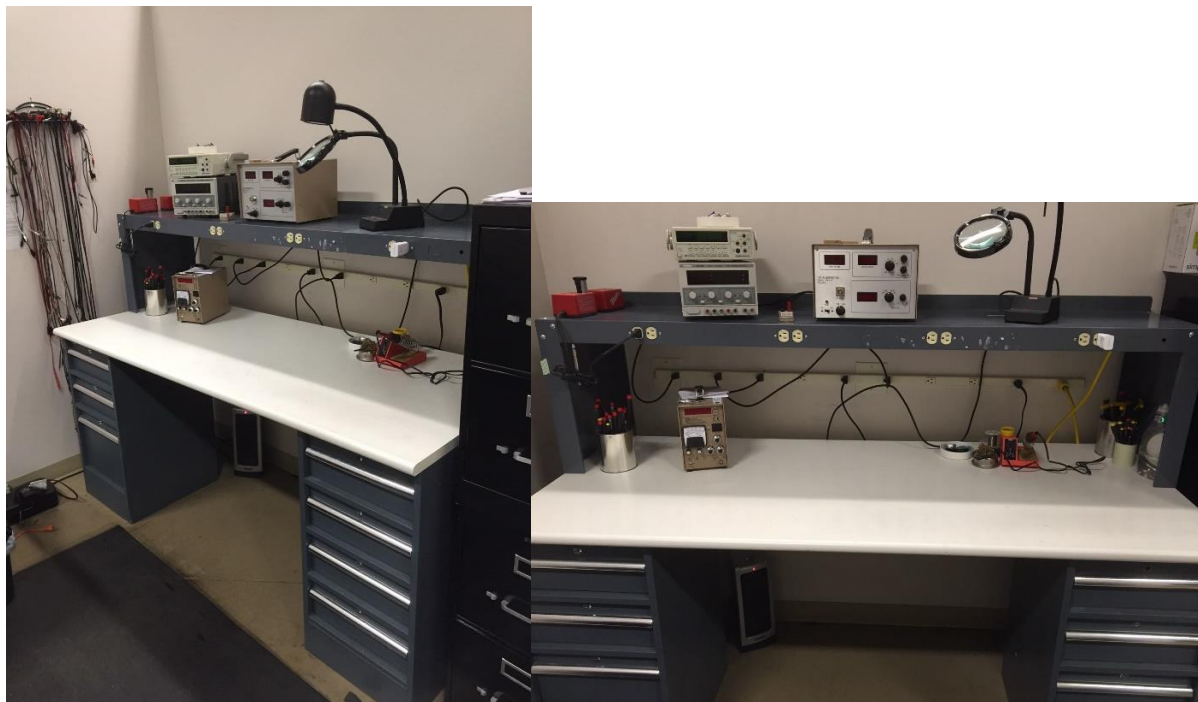
Figure 1. Typical Technician Work Bench Views

MJWTS has 3 technician bench stations at our Olean facility. The attached Table 1 shows a spreadsheet which lists all this equipment that is for sale and the asking prices which are similar to used equipment available from various vendors. Four stations can be supplied with this equipment. Two scalers, one pulser, one multimeter, 2 oscilloscopes, 2 bench power supplies, one 44-9 probe holder and one high voltage divider box will be needed to complete all four stations. Figures 1 through 7 show pictures of some of this equipment. Figures 8 and 9 show the station furniture. Figure 10 shows the tool drawers for one of the stations. Additional tools also shown after Figure 10.